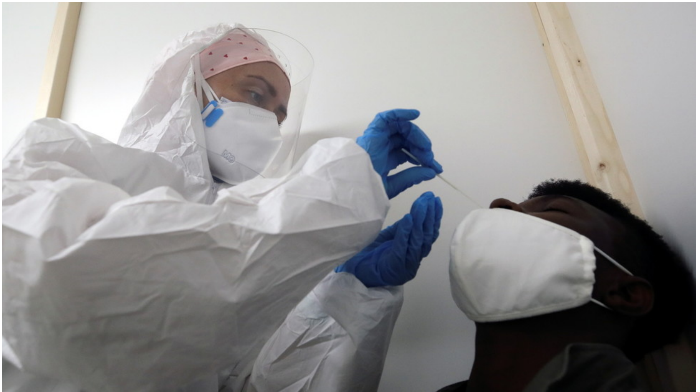
A member of the medical personnel performs a PCR test amid the outbreak of the coronavirus disease (COVID-19), in Charleroi, Belgium, November 5, 2020