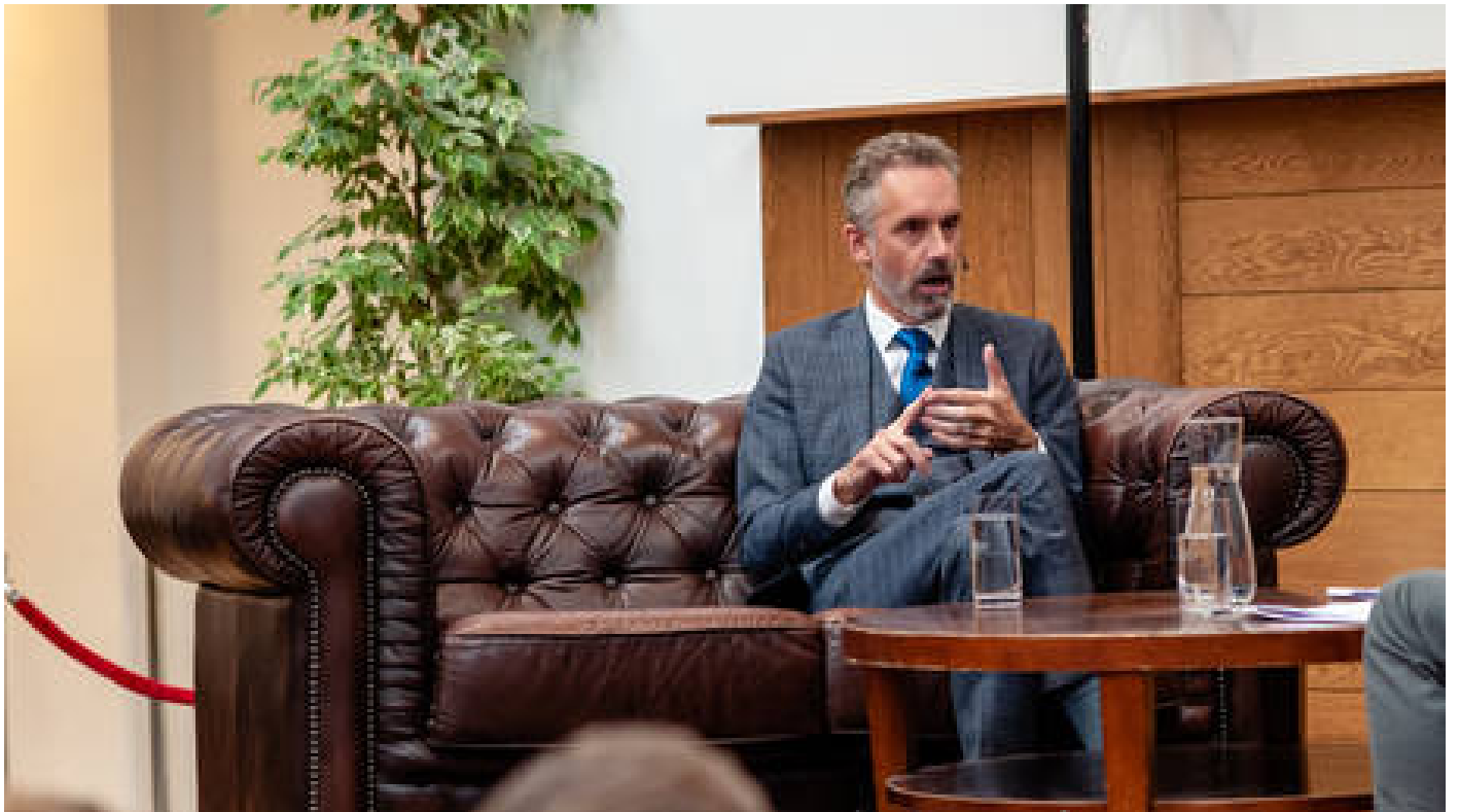
Anti-woke professor Jordan B Peterson's new self-help book for the masses will sell millions. No wonder the liberals are in tears

This website uses cookies. Read RT Privacy policy to find out more.